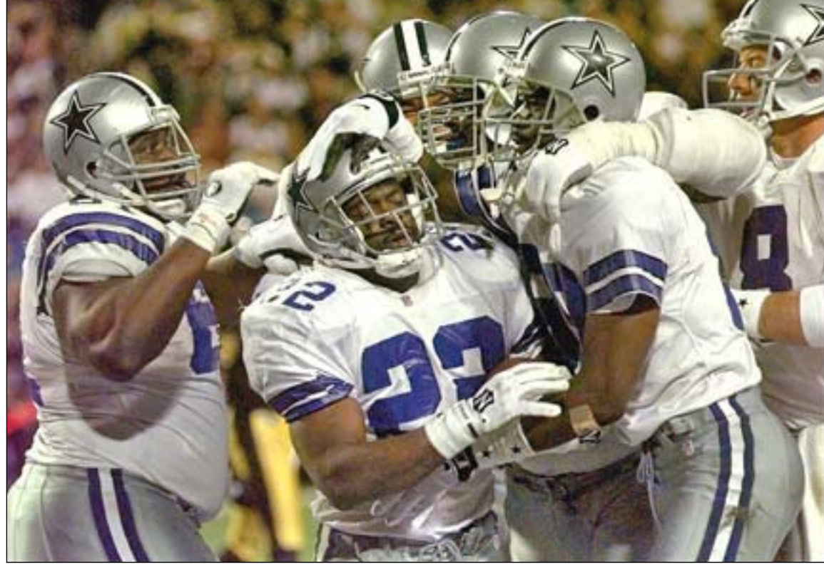
GOOD JOB!: Cowboys, including offensive guard Nate Newton (#61, Florida A&M , left), celebrate with running back Emmitt Smith after one of his two second-half touchdown runs that helped Dallas beat Buffalo 30-13 in Super Bowl XXVIII.