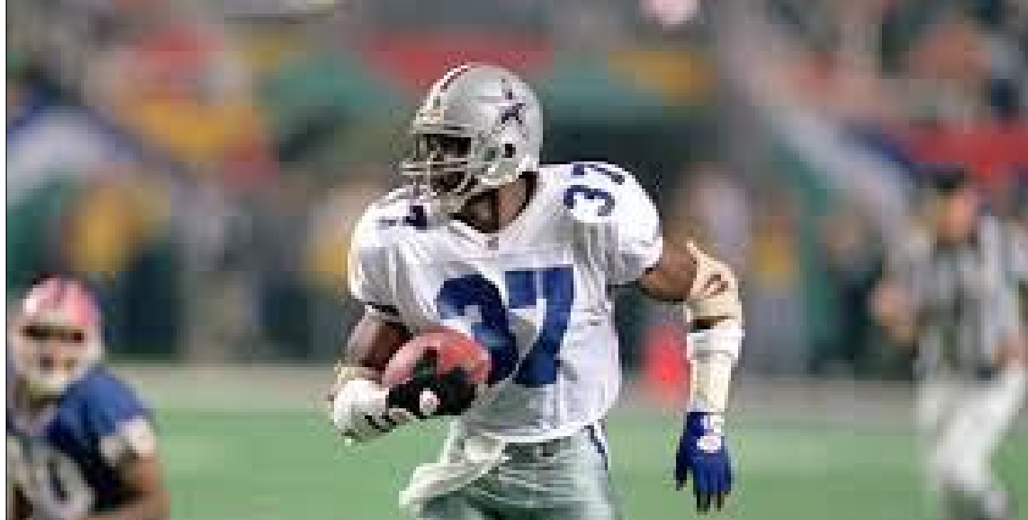
PULLING AWAY: Dallas safety James Washington (#37) runs free for 47 yards and an early third-quarter touchdown after picking up a fumble by Buffalo running back Thurman Thomas. The TD return allowed Dallas to tie the score at 13 with 14:05 left in the third quarter of Super Bowl XXVIII. The Cowboys trailed 13-6 at the half but had 24 unanswered second-half points.