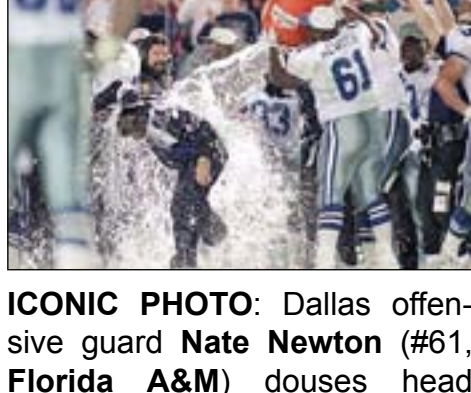
ICONIC PHOTO: Dallas offensive guard Nate Newton (#61, Florida A&M ) douses head coach Jimmy Johnson after Cowboys' win in Super Bowl XXVIII.